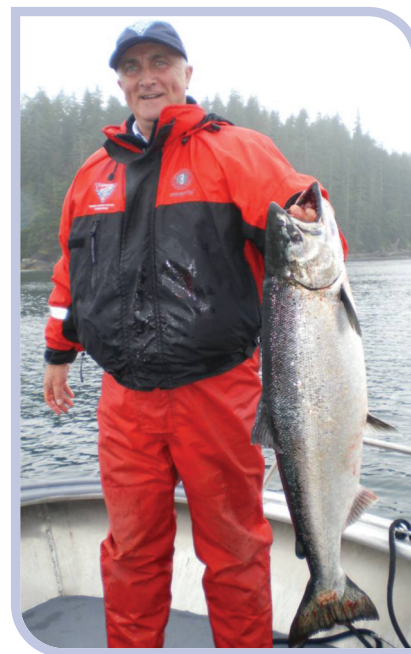
"I did catch a 21.5lbs salmon!"